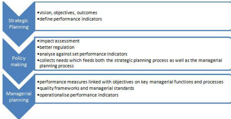
Figure 2. Sub-components of a decision-making model of performance

sult oriented and very willing to adopt instruments of the neo approach, the Napoleonic states are rather oriented towards norms and legal codification, making the adoption of flexible and market oriented performance models very difficult. However, recent studies (Bouckert and Pollit, 2010) reflect an increased ‘appetite’ for reforms in legalistic systems.